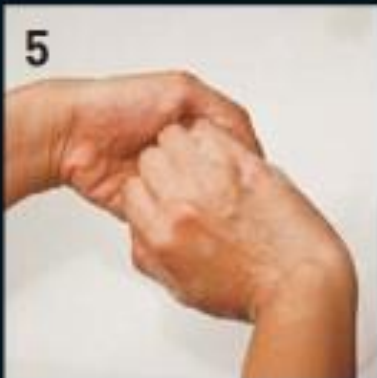
5 Back of fingers