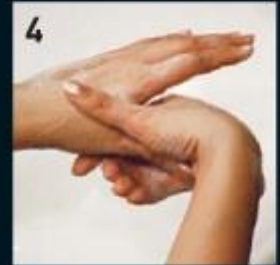
4 Base of thumbs