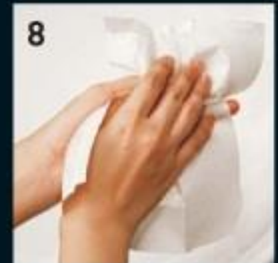
8 Rinse and wipe dry