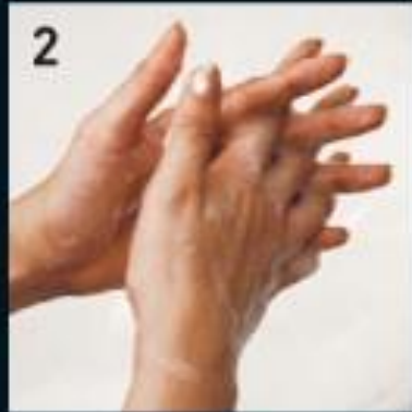
2 Between fingers