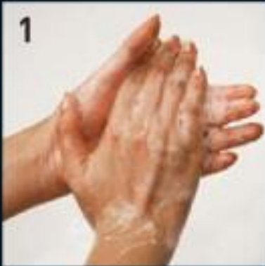
1 Palm to palm