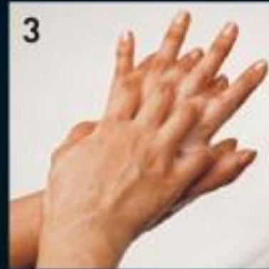
3 Back of hands